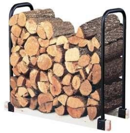
A firewood rack is a nice way to store your wood; you can also buy a cover to keep the wood dry!